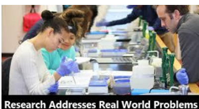
Research Addresses Real World Problems