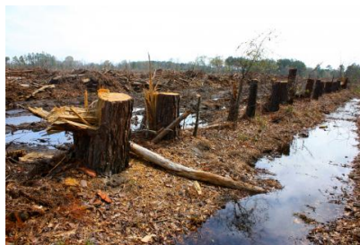
The Lorax View this asset at:

\underline{http://www.awesomestories.com/asset/view/The-Lorax-Magical-Trees}