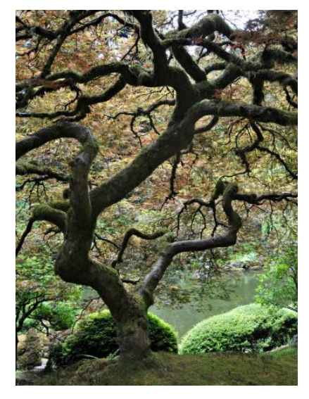
The Lorax - Magical Trees

Photo of the Ornatum tree at <u>Japanese Garden</u> - Portland, Oregon - by Martin Ystenes, online via Flickr. Copyright, Martin Ystenes, all rights reserved. Image provided here as fair use for educational purposes.