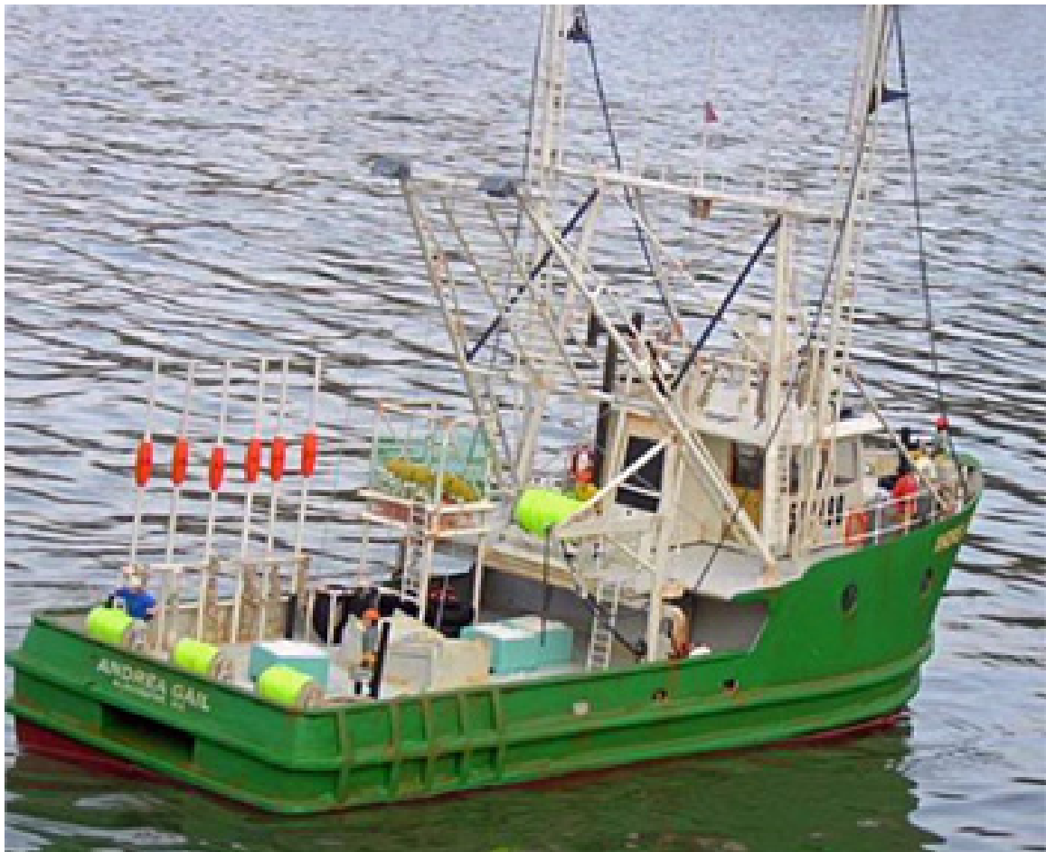
Andrea Gail, the ship which was lost during 1991's "Perfect Storm."