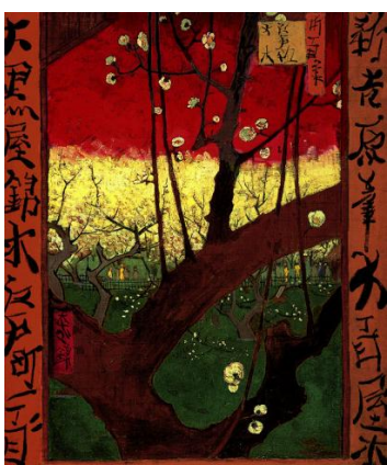
<u>van Gogh Copies Hiroshige - Plum Tree</u> Image online, courtesy <u>The Woodblock Prints of Ando Hiroshige</u>. PD

http://www.awesomestories.com/asset/view/van-Gogh-Copies-Hiroshige-Bridge-in-the-Rain