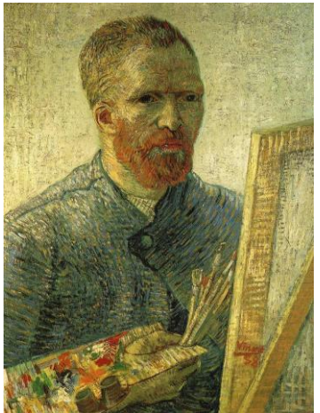
van Gogh - Self Portrait in Front of Easel, 1888 Image online, courtesy Vincent van Gogh Gallery. PD View this asset at:

View this asset at: http://www.awesomestories.com/asset/view/Oiran-A-Painting-by-van-Gogh