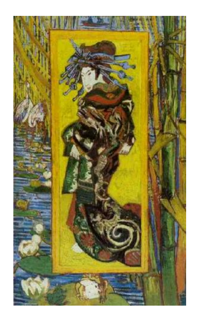
<u>Oiran - A Painting by van Gogh</u>

View this asset at: http://www.awesomestories.com/asset/view/Oiran-A-Painting-by-van-Gogh