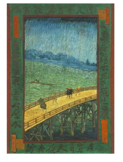
\frac{van\ Gogh\ Copies\ Hiroshige\ -\ Bridge\ in\ the\ Rain}{Image\ online,\ courtesy\ \underline{The\ Woodblock\ Prints\ of\ Ando\ Hiroshige}}. PD

http://www.awesomestories.com/asset/view/van-Gogh-Self-Portrait-in-Front-of-Easel-1888