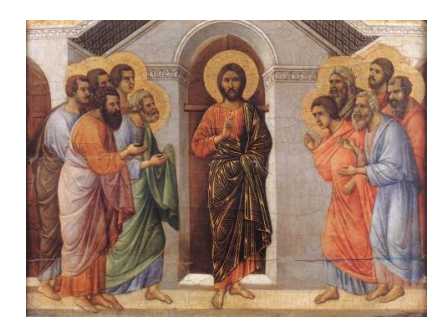
<u>Jesus - Visits His Disciples</u> Image online, courtesy Web Gallery of Art. PD