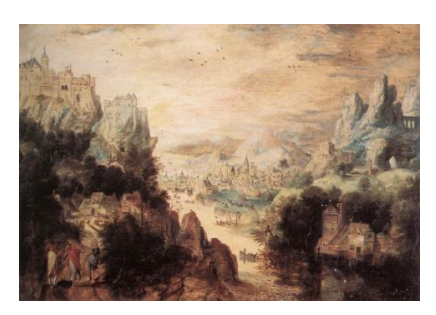
Road to Emmaus

http://www.awesomestories.com/asset/view/Jesus-Visits-His-Disciples