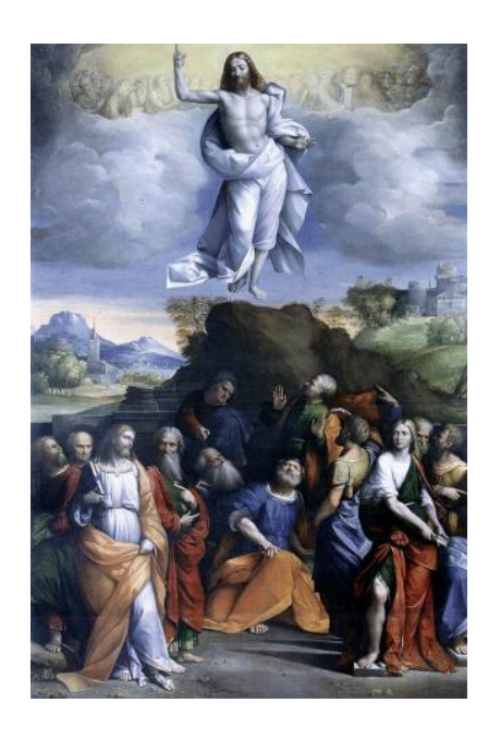
<u>Garofalo - The Ascension of Jesus</u> Image, described above, online courtesy <u>Web Gallery of Art</u>. PD