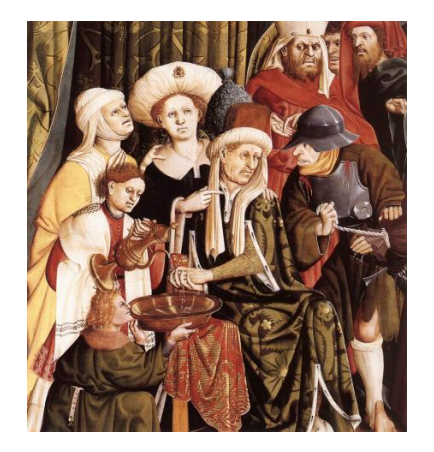
Trial of Jesus - Pilate Washes His Hands

http://www.awesomestories.com/asset/view/Trial-of-Jesus-Pilate-Talks-with-the-Crowd