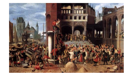
Trial of Jesus - Pilate Talks with the Crowd

http://www.awesomestories.com/asset/view/Trial-of-Jesus-Crown-of-Thorns