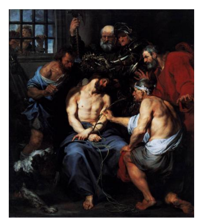
Trial of Jesus - Crown of Thorns

http://www.awesomestories.com/asset/view/Trial-of-Jesus-Second-Interrogation-by-Pilate