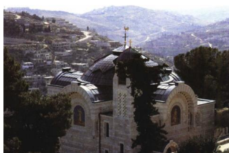
House of Caiaphas - Reputed Location

View this asset at: http://www.awesomestories.com/asset/view/House-of-Caiaphas-Place-of-First-Trial