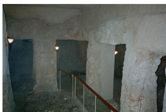
House of Caiaphas - Place of First Trial

http://www.awesomestories.com/asset/view/Trial-of-Jesus-Steps-at-the-House-of-Caiaphas