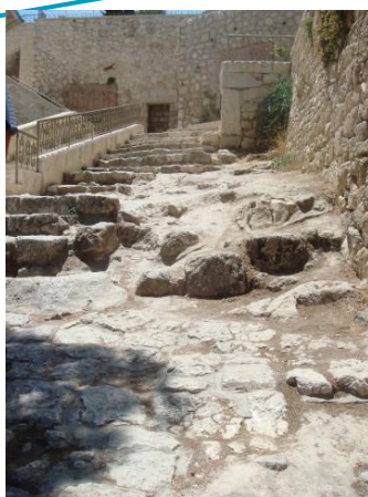
Trial of Jesus - Steps at the House of Caiaphas