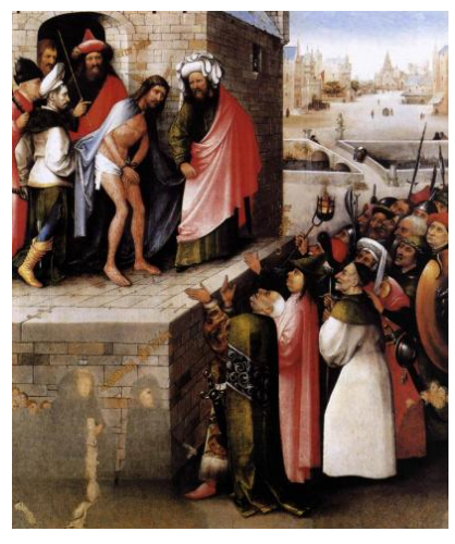
<u>Jesus - After a Beating</u>

http://www.awesomestories.com/asset/view/Triumphal-Entry-in-Stained-Glass